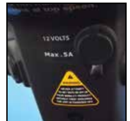
Handy 12 volt socket

Overall Dimension : A x B x C 130 x 69 x 125cm/51 x 27 x 49"