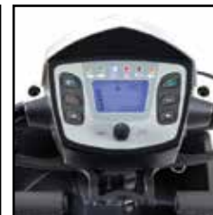
Digital LCD dashboard display