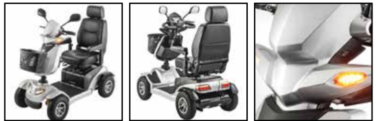
Modern LED lighting system