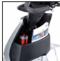
More space for storage