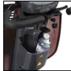
Extra storage & Shopping bag hook.