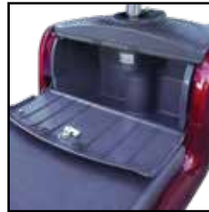
Lockable storage drawer underneath the seat.