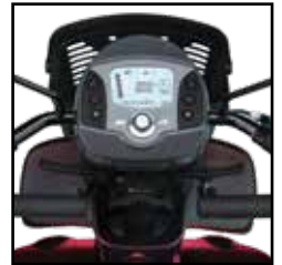
Digital LCD Dashboard Display.