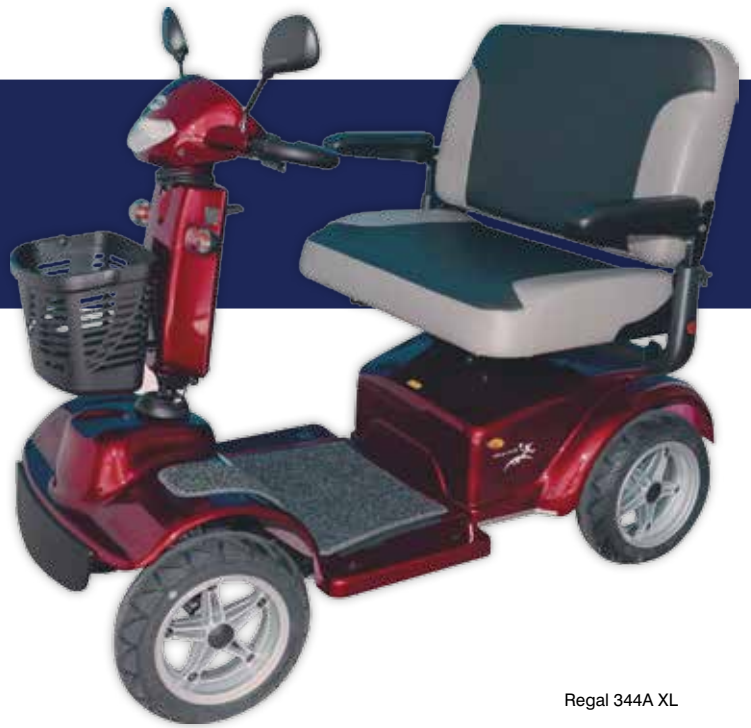
Regal 344A XL