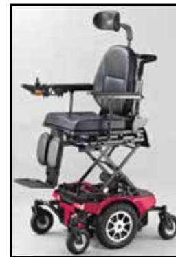
Seat elevator travel range: 30cm/12inch