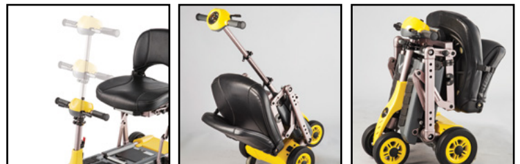
Height adds taller